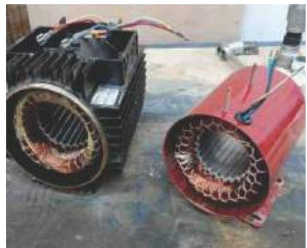
Electric motors under rewinding