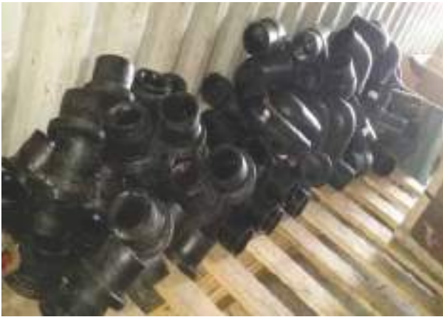
Stocks of HDPE Pipes Fittings

Lobosway Global Resources Ltd provide High Density Polyethylene (HDPE) pipes, piping and pipe welding machines for manufacturing Companies, Petrochemical, Food and drink, Construction Companies etc. Our HDPE Product includes, Pipes, Elbows, Tee, Reducers, Sockets, Flanges, HDPE Fusion Machines etc. both Electro, Butt and mechanical fusion types.