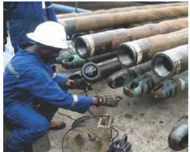
Inspection of drill collars