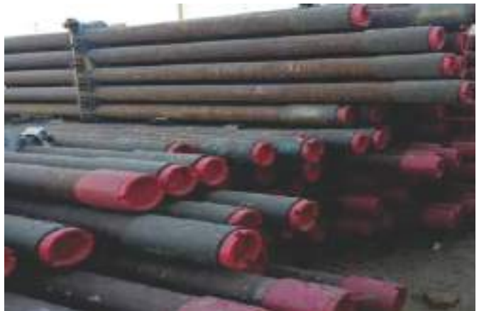
Threaded Pup Joints