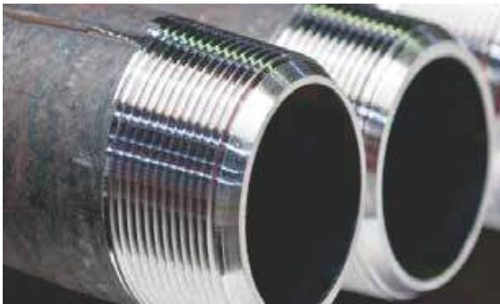
6-5/8" Casing Pipes