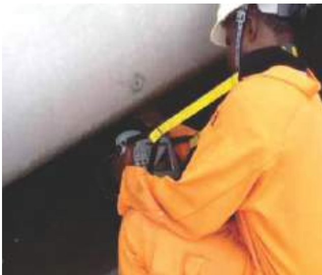
Ultrasonic flaw detector

We provide Radiographic, Ultrasonic, Magnetic particle testing, Liquid Penetrant Testing, Hardness Testing, PMI, Pre & Post Weld Heat Treatment, Ultrasonic Thickness Measurement.