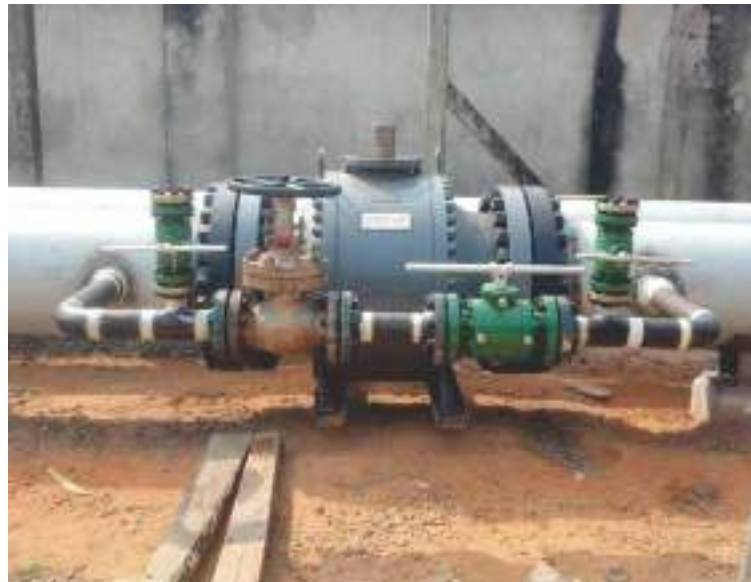
Refurbished 10" pig launcher/receiver