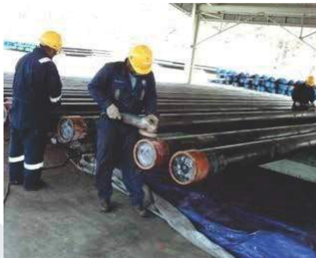
Cleaning of 9-5/8 Casing pipe for Inspection