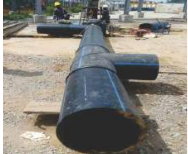
Welding of HDPE Pipes