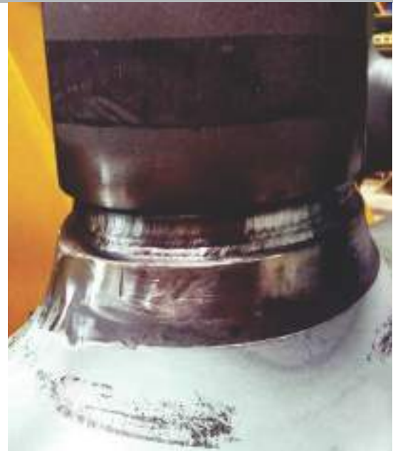
TIG Welding of stainless steel at client location

We have gained expertise in providing Fabrication/Welding services to our clients both in onshore and offshore environment.