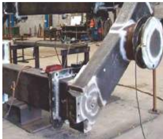
Finished MPI on offshore Structure