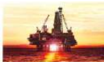
IVERSON INVESTMENTS LLC DBA WAYNE INTERNATIONAL