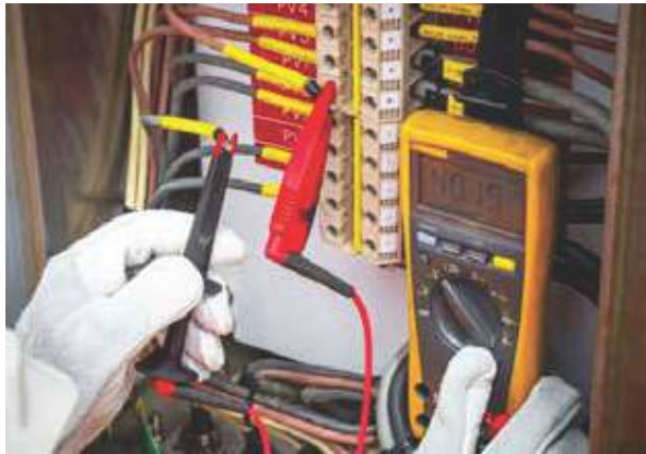
Troubleshooting of electrical Panel