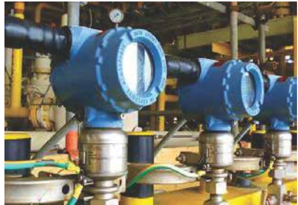
Replacement of instrument control system