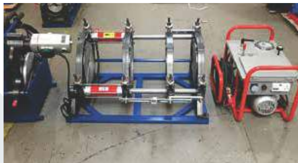
Our Multipurpose Fusion welding Equipment