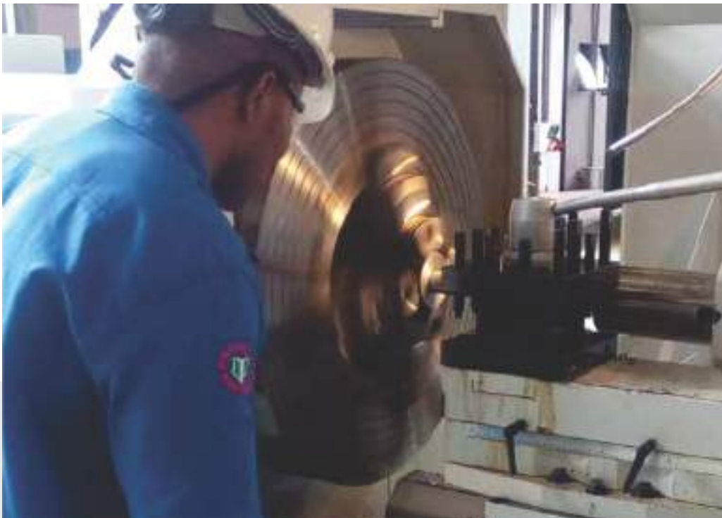
Machining of Critical Parts

Fabrication of Mud Can, Tool Basket, Drip Containment Tray & Structural fabrication as per specification.