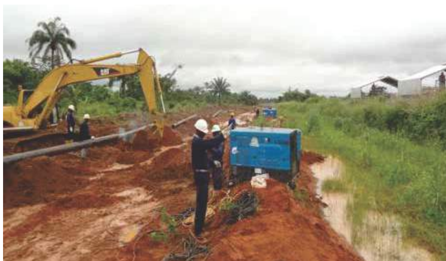
Pipe Laying of 16" x 3km gas Pipeline along Okpella