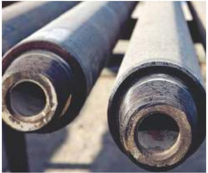
Drill pipes for threading