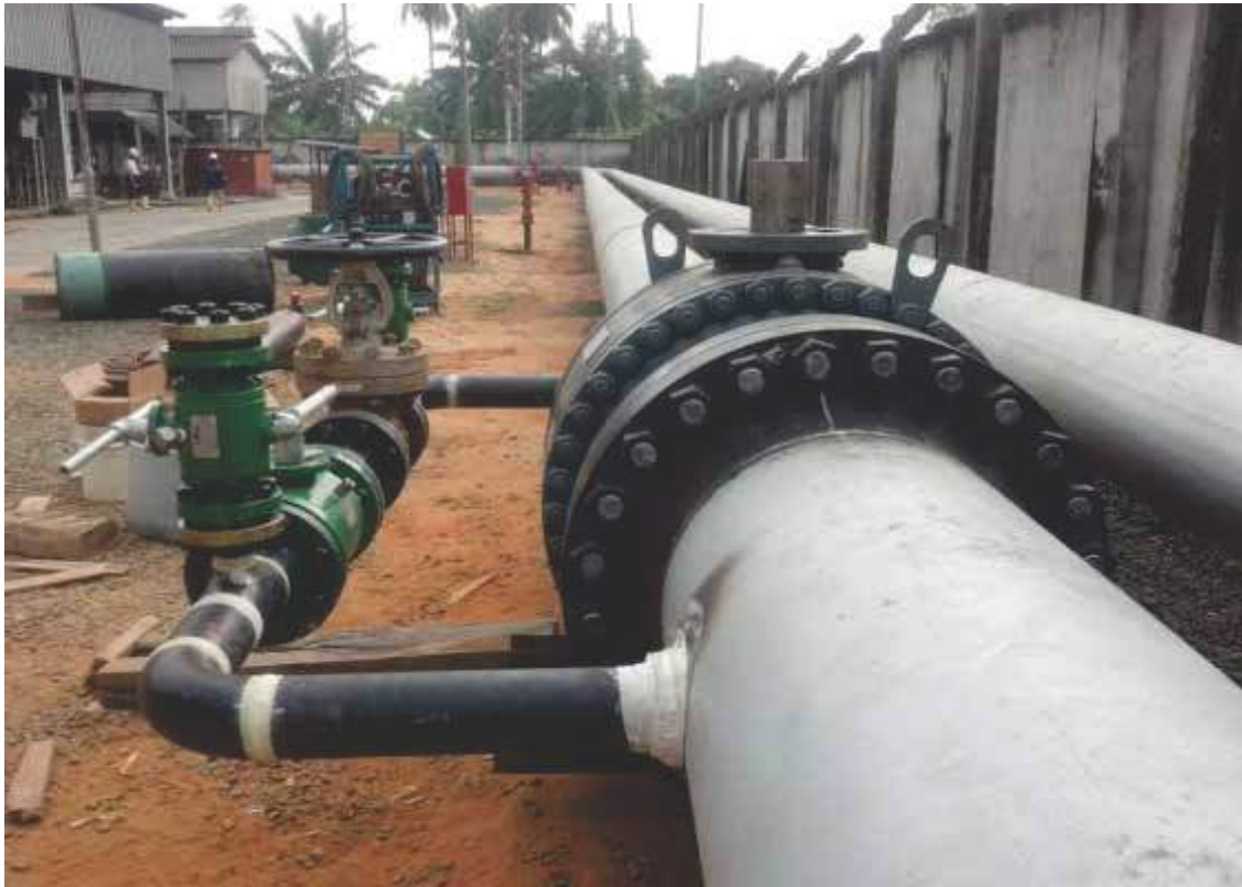
Installed Fabricated by-pass line