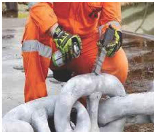
Magnetic Particle test