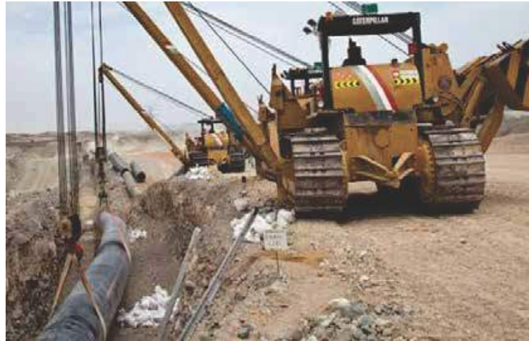
Pipe Laying Services